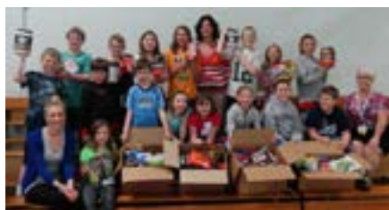
Students from St. John's Middle school keep the kindness acts going by mailing packages to the military as part of our Kindness Projects through CHN's Read, Run, Reach Program.